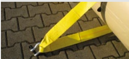
Hoisting slings with shackles