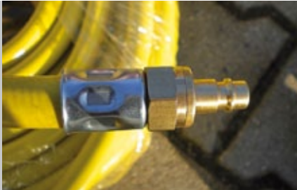
Self closing quick-connectors